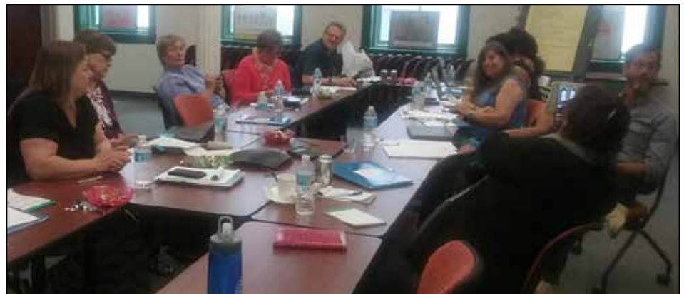
Meeting of the PCORI Advisory Workgroup in Baltimore

Advisory Council members include family leaders from 11 states and prominent researchers in the field: