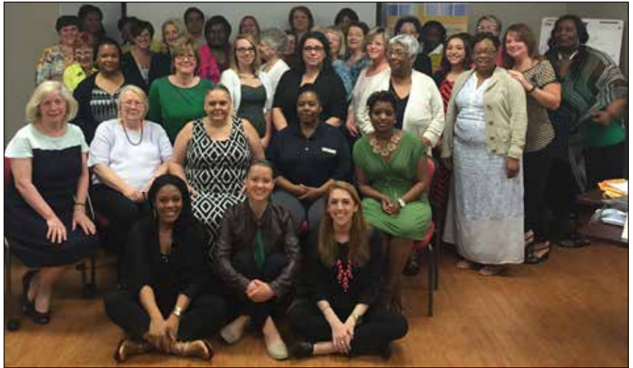
Small Group Meeting of Family Leaders in Phoenix, AZ