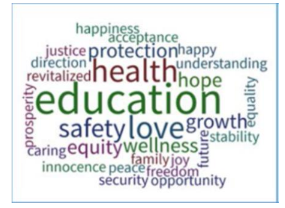
Our vision for young children Word cloud developed at Family Leadership Summit February 2018

https://www.youtube.com/watch?v=QkY7mTndepl&index=9&list=PLWv-X8-WjcQU_c8KGqlCFHnANnKQzcXso